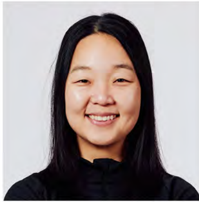
BOMI PARK FIRST TEAM ADMIN