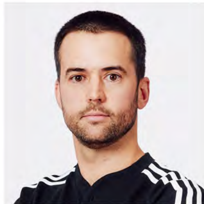
PETER ALSTON ACADEMY STRENGTH & CONDITIONING