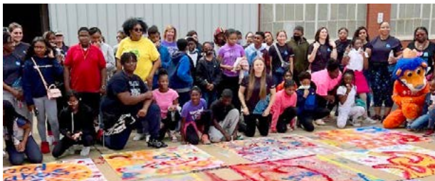
ADOPT A CLASS DAY OF SERVICE