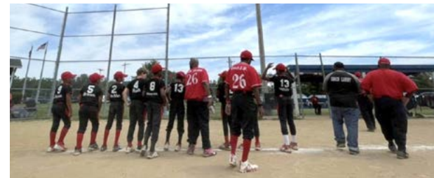
WEST END REDS