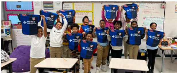
ADOPT A CLASS CLASSROOM SESSION