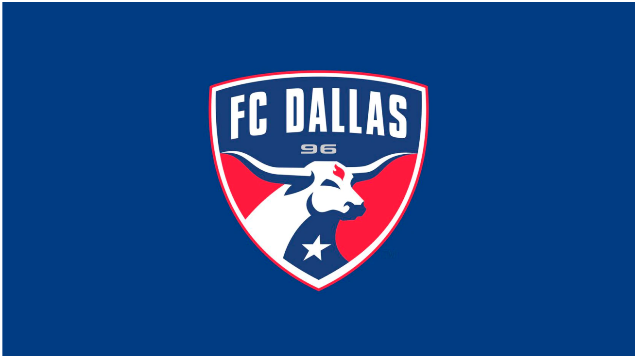
FC Dallas logo.

Each member of the class will receive an individually customized FCD corporate partnership package.