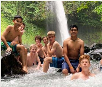
La Fortuna Waterfall INCLUDED IN COST