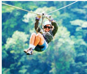
Canopy zipline tour INCLUDED IN COST