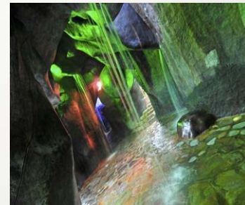
Volcanic Hot Springs INCLUDED IN COST