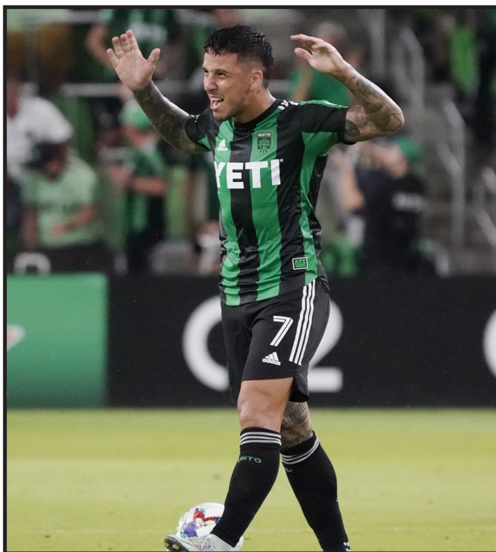
Austin FC forward Sebastián Driussi finished tied for the second-most goals in MLS in 2022 (22).