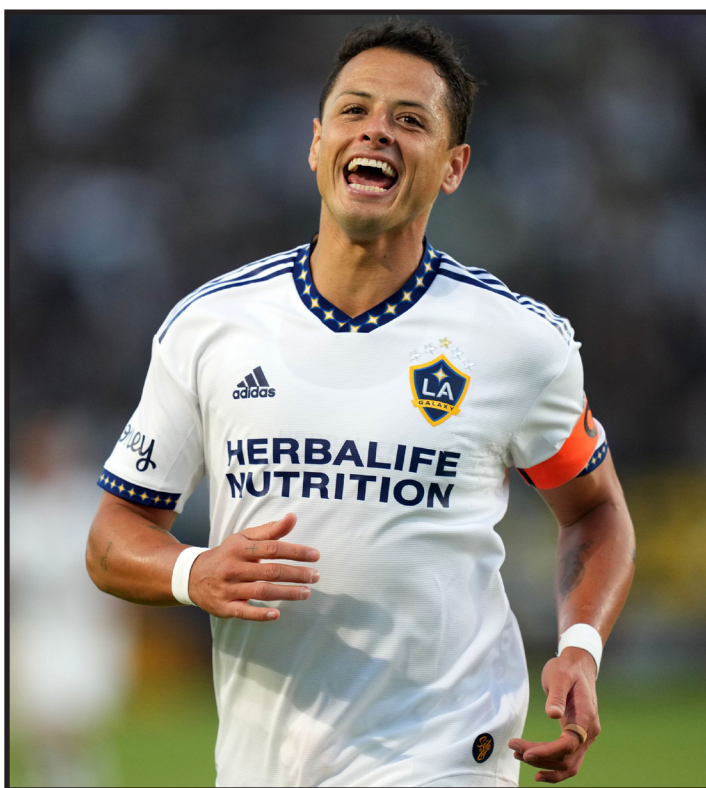
LA Galaxy forward Javier 'Chicharito' Hernández led the club in goals for the second straight season after producing 18 in 2022.