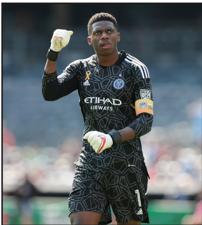
New York City FC goalkeeper Sean Johnson tied for the fourth-most clean sheets in a season in MLS history with 14.