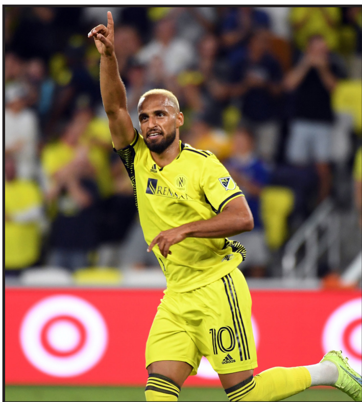
Nashville SC midfielder Hany Mukhtar won the 2022 MLS Golden Boot presented by Audi after scoring 23 goals this season.