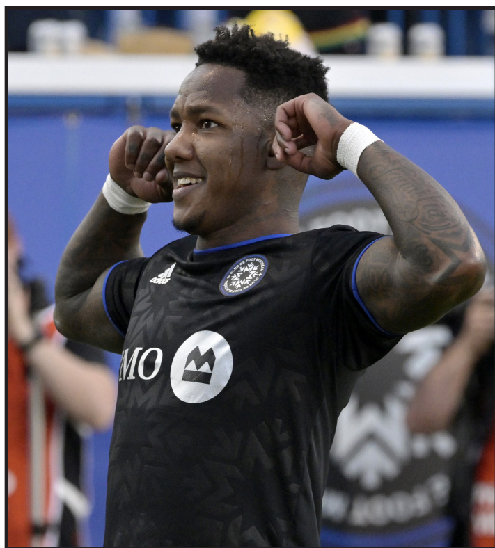
CF Montréal forward Romell Quioto became just the third player in club history to score at least 15 goals in a single season.