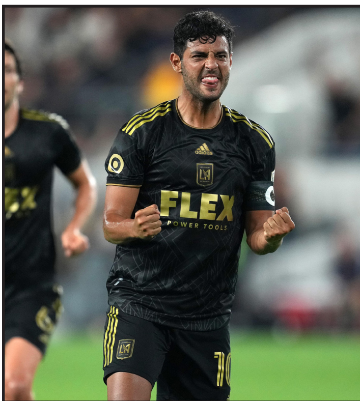
LAFC forward Carlos Vela recorded his third different season with at least 10 goals and 10 assists in 2022.