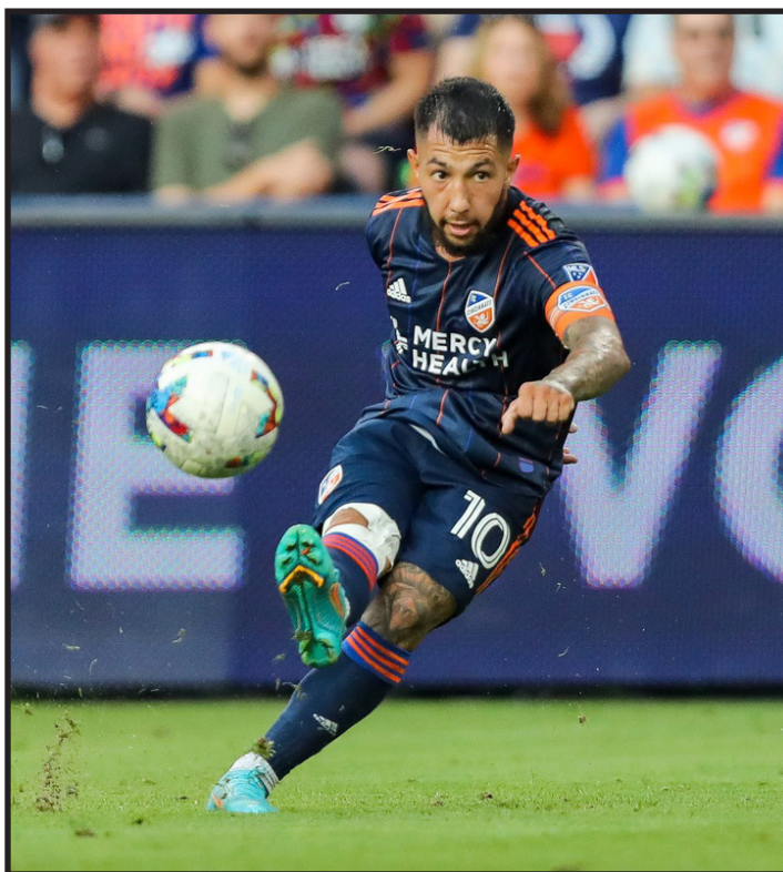
FC Cincinnati midfielder Luciano Acosta produced the most assists in MLS in 2022 when he totaled 19 on the season.