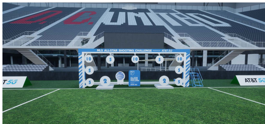
MLS ALL-STARS v Arsenal FC - Audi Field - Washington, D.C.